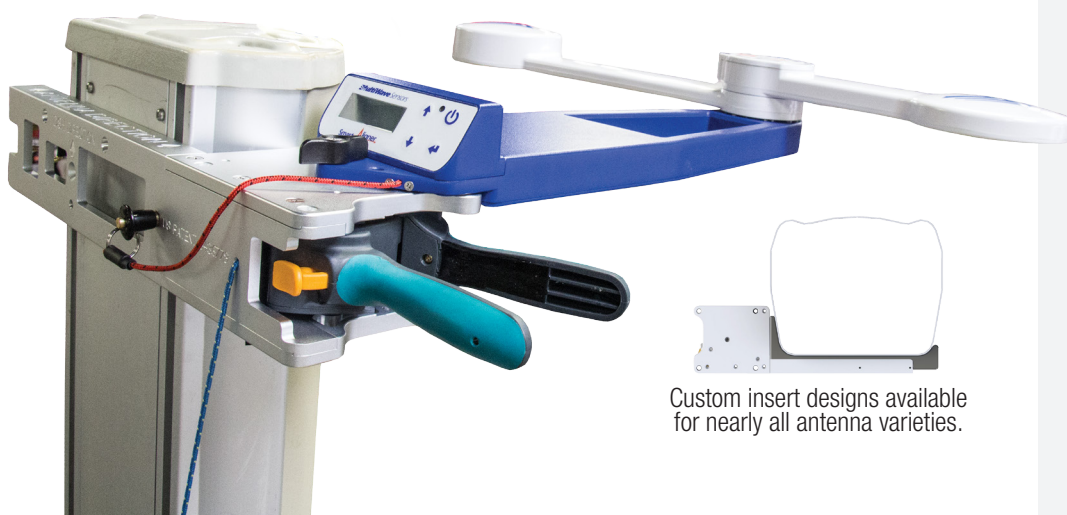
Custom insert designs available for nearly all antenna varieties.