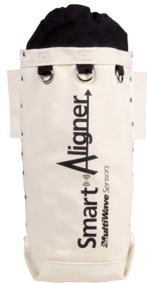
Extra tall pouch included