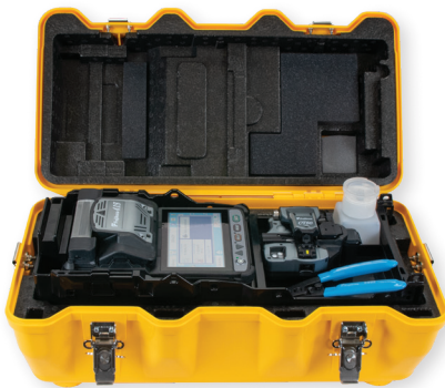
Workstation in Transit Case

Backed by the best service team in the industry, the Fujikura 41S is the ideal splicer to use when portability, ruggedness, and reliability are needed for your splicing application.