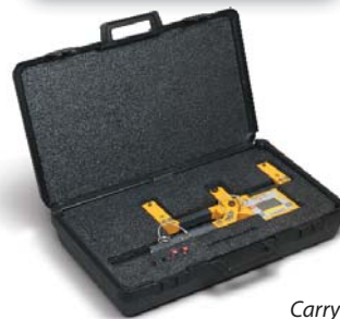
Carry case included

Dillon also manufactures highly accurate electronic and mechanical dynamometers and crane scales.