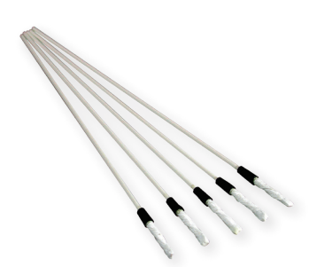
Type 2.5 mm